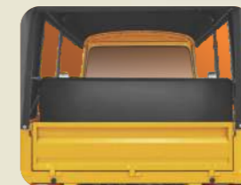
Extra Luggage Space