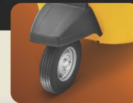
Tubeless Tyres First in 3 Wheeler Segment