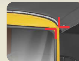
Excellent Build Quality