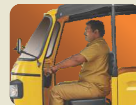
Super-spacious Driver Cabin